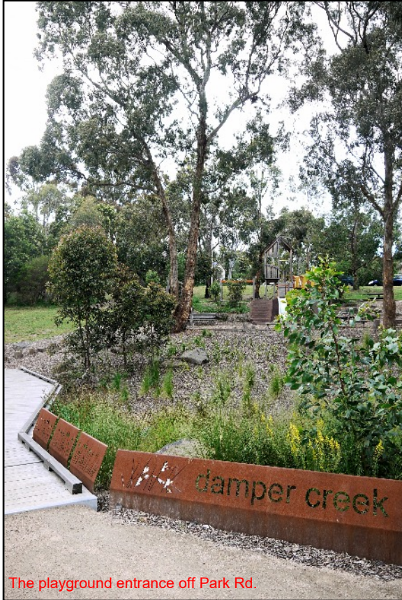
The playground entrance off Park Rd.