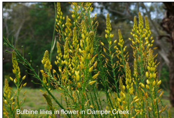
Bulbine lilies in flower in Damper Creek

When you shop at Ritchies IGA at Hamilton Place or another IGA supermarkets ask for a Community Benefits card and register it to the Friends of Damper Creek. A percentage of your purchases is credited to the Friends group. The money received by us is spent on Damper Creek Reserve.