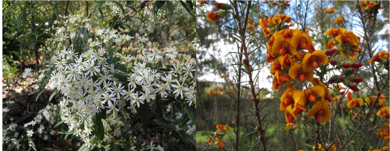
Olearia lirata (Snowy Daisy Bush)

The Hedge Wattle and Prickly Moses are two wattles you may think twice about before planting in your garden. The former has some of the brightest flowers in the Wattle family. However, the spines are extremely long and sharp, hence the name and its use as a temporary fence by early settlers. Prickly Moses is quite irritating to the touch. It is not long lived and is smaller in stature than the Hedge Wattle. Both plants provide excellent habitat for small birds so you should consider finding a corner in your garden for these plants.