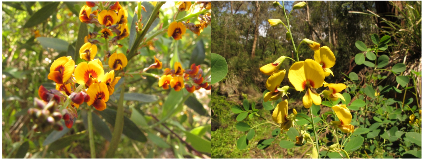
Hop Bitter-pea: Daviesia latifolia Latifolia = broad-leaved

Right: Swamp paperbark: Melaleuca ericifolia. A shrubby plant that inhabits the stream bank.