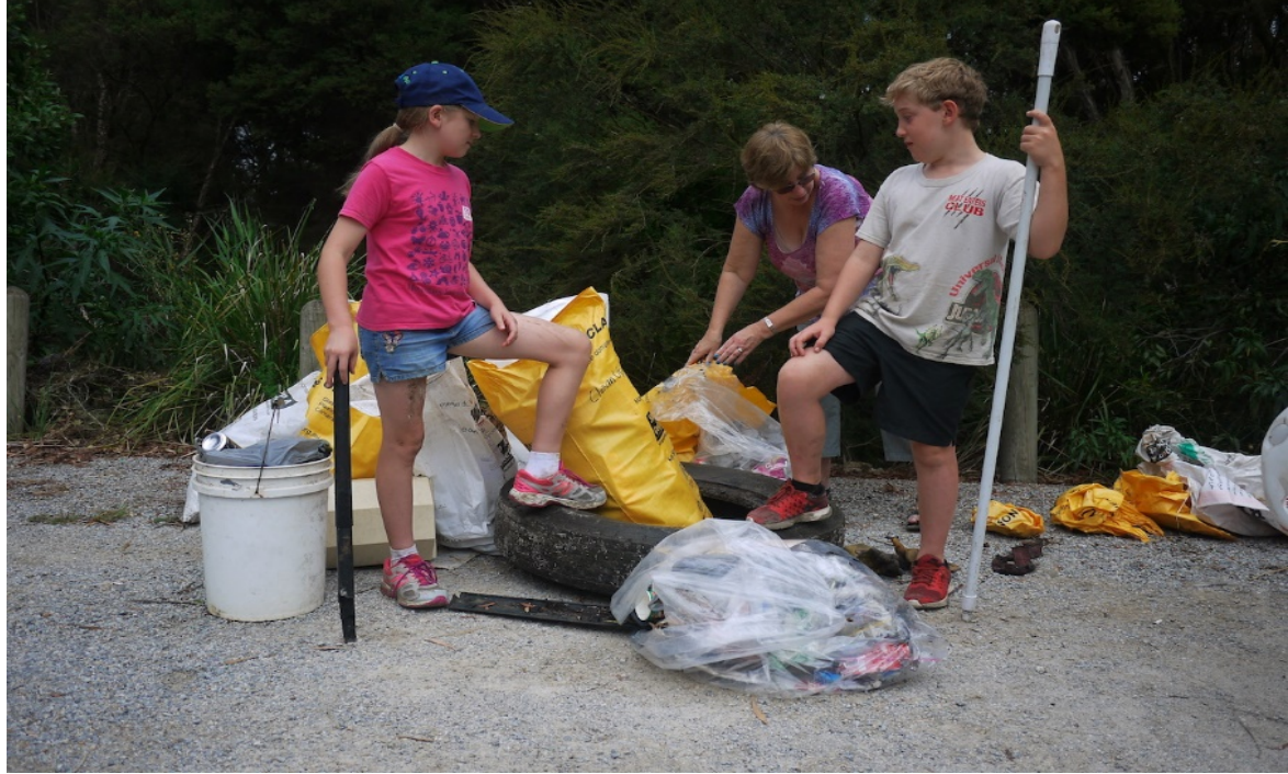
Some of the participants and the rubbish collected between Alvie Road and Stephensons Road. The rubbish included a "camp" discovered in a secluded part of the creek near the corner of High Street Road and Stephensons Road.