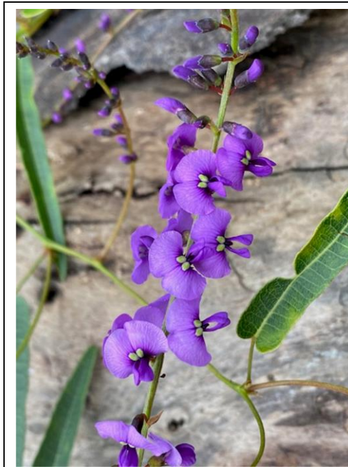
Purple Coral Pea

The nursery form known as “Happy Wanderer” is also known as “Sarsparilla”.