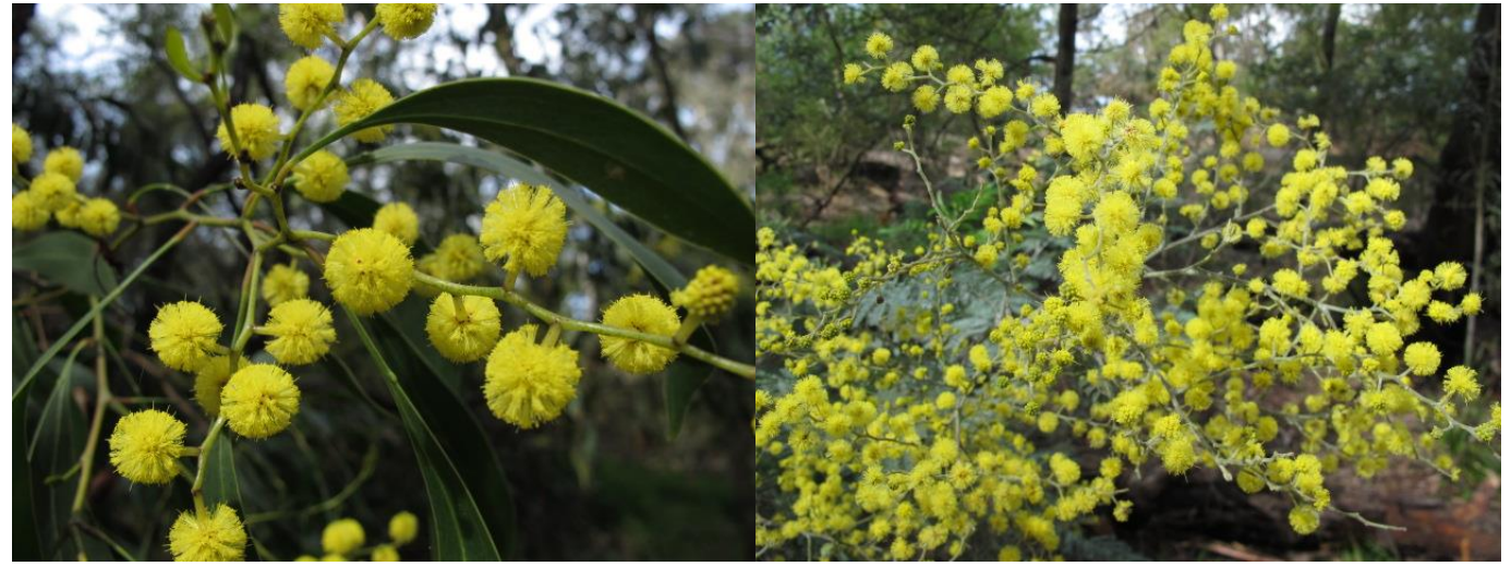
Golden Wattle Silver Wattle