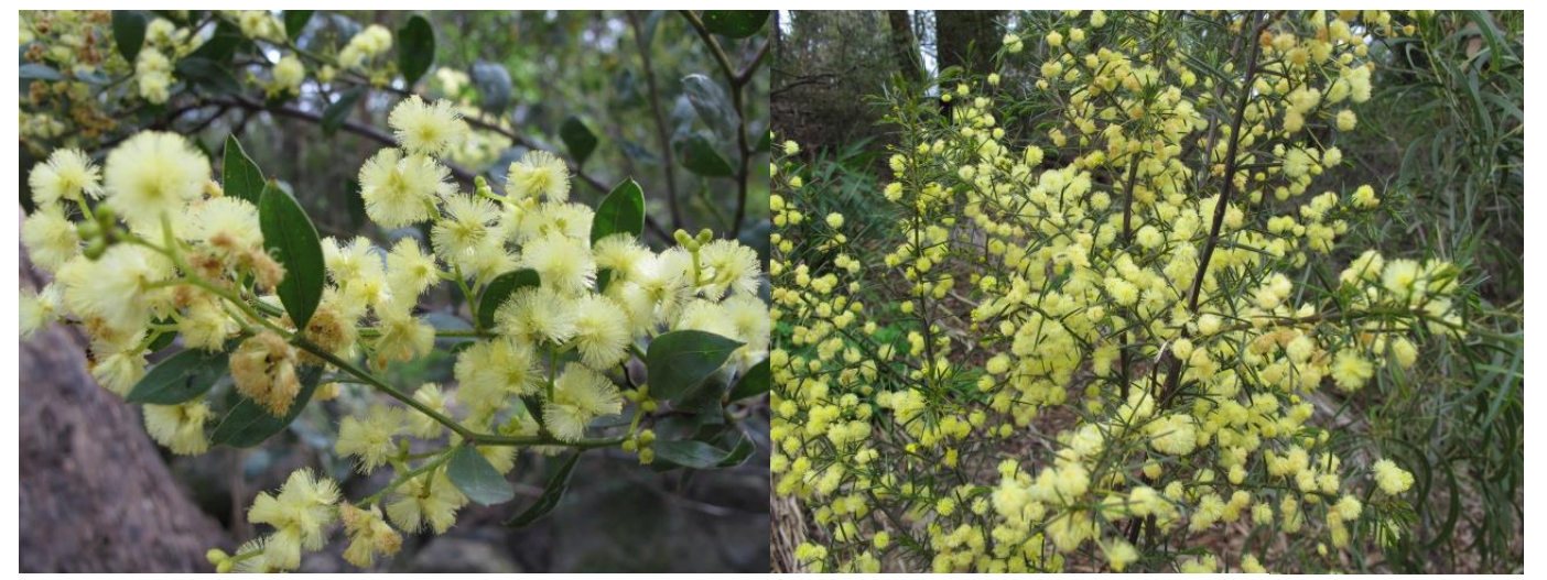
Myrtle Wattle Spreading Wattle

As a group of plants, the wattles are incredibly variable. There are around 950 species in Australia. They range from insignificant ground cover plants that can be lost within the grasses, to forest giants. Many are short lived but others grow to be large trees with superb timber such as the Blackwood which, in the Gippsland forests grows to over 30m and provided timber for much of Australian furniture in the early 1900's. They all have hard seeds which survive in the soil for decades. The seed case can split under the heat of fire and wattles can be the dominant vegetation following a bushfire. Wattles also fix Nitrogen and make it available to other plants as a fertiliser. Many associate wattles with hay fever but the pollen of wattles is heavy and doesn't remain airborne.