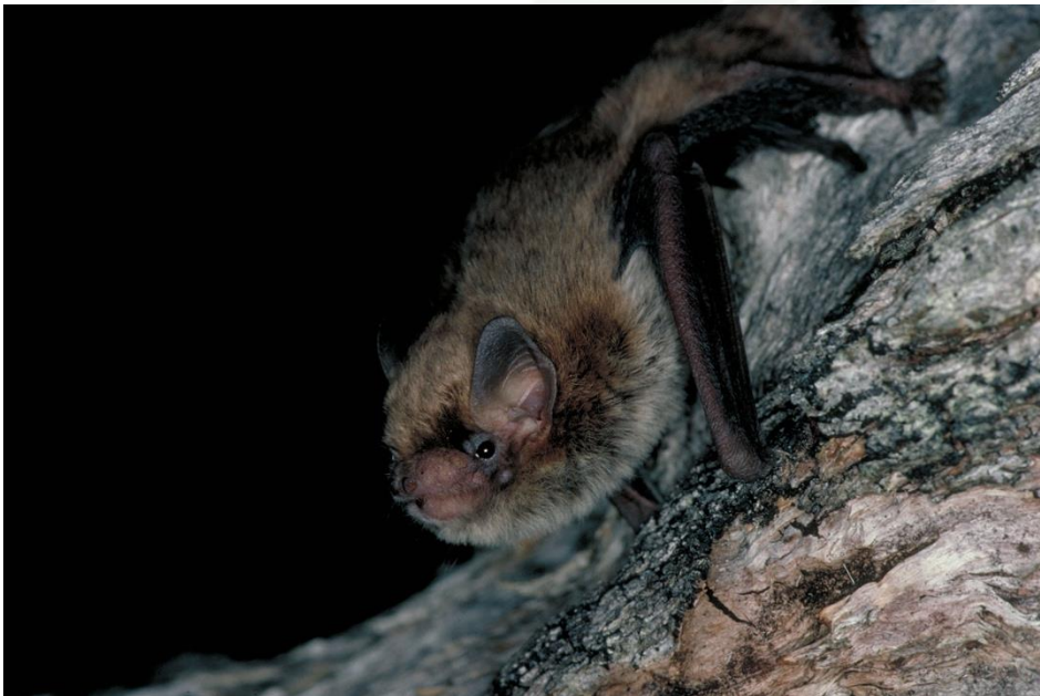
Little Forest Bat.

https://www.wildlifevictoria.org.au/learn/fact-sheets/microbats