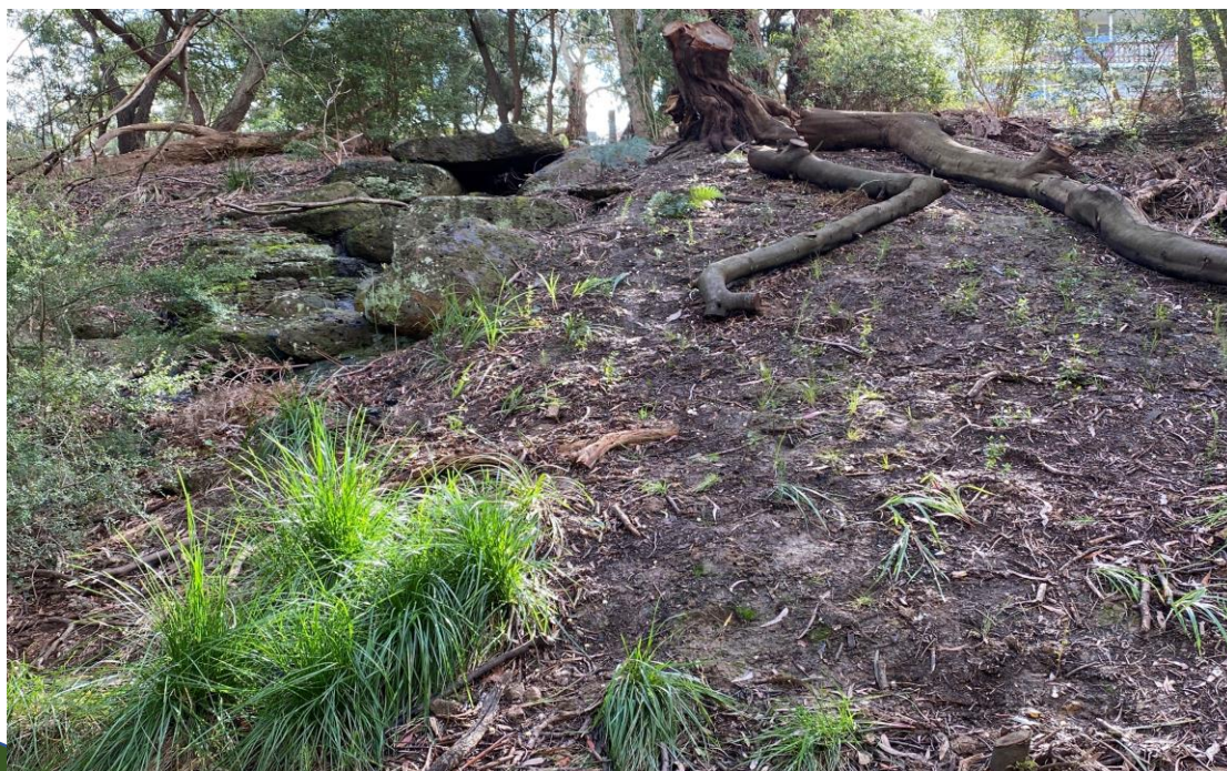
New plants by the #2 waterfall

Unused funds from the Melbourne Water Grant which were originally allocated for administration, will now be topped up with FODCCR funds to purchase an additional $1100 worth of additional plants. The 2021/2022 growing season promises to be fantastic for Damper Creek.